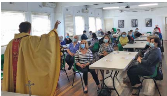
Mass at Bingo

It was wonderful when Masses resumed on Tuesday 19 October 2021 after the long closure of the churches due to the COVID-19 lockdown in Greater Sydney.