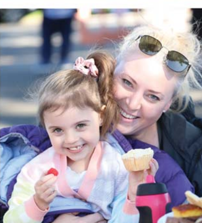
Australia's Biggest Morning Tea