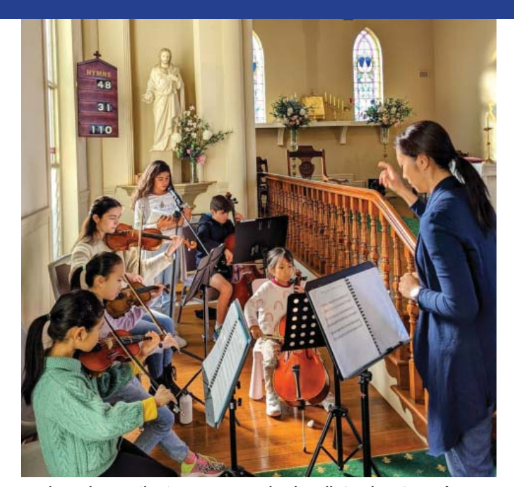
and we hope that you are enjoying listening to us!

It has been a great experience playing in an ensemble