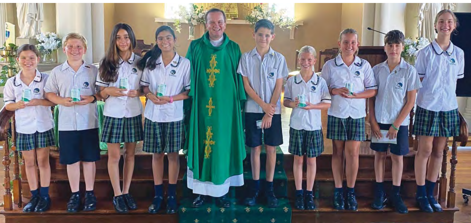
Below: School Leaders