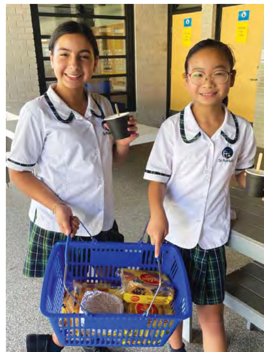
Right: School Shrove Tuesday pancakes